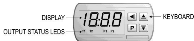
Figure 2 – Front Panel

The signaler P1 at the front panel of the controller will light up when the control output is activated. The signaler P2 light up when the booster output is activated.