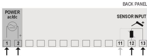
Figure 1 – N320 terminals

Figure 1 below shows the temperature meter connections to sensor, mains and outputs.